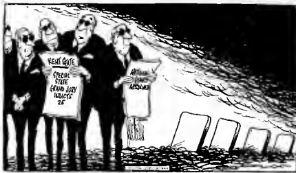
... WE FIND THAT THE STUDENTS DID ATTACK NATIONAL GUARD BULLETS WITH THEIR BODIES"